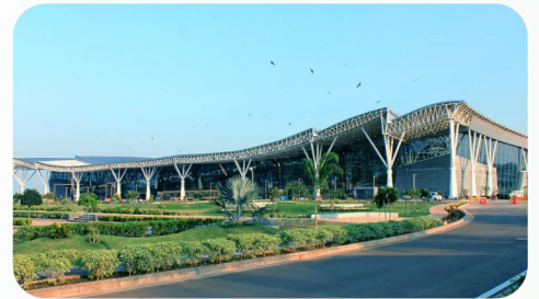
Swami Vivekananda Airport