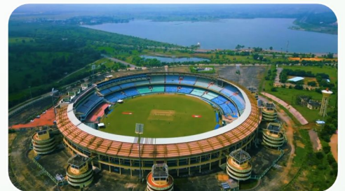
Shaheed Veer Narayan Singh International Cricket Stadium