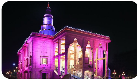
Sri Ram Mandir